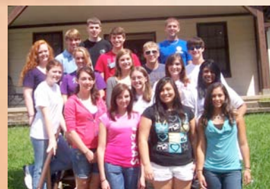
K-T District Board at Kiwanis Fresh Air Camp in July 2009 in Knoxville, TN

K-T District will provide limited transportation so reserve your spot today! Registration fee is expected to be $160 per student, based on quad occupancy. Sign up today, you don't want to miss this-it will be the highlight of your year!!